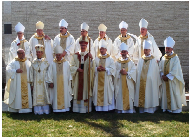
Bishops attending the blessing of the seminary