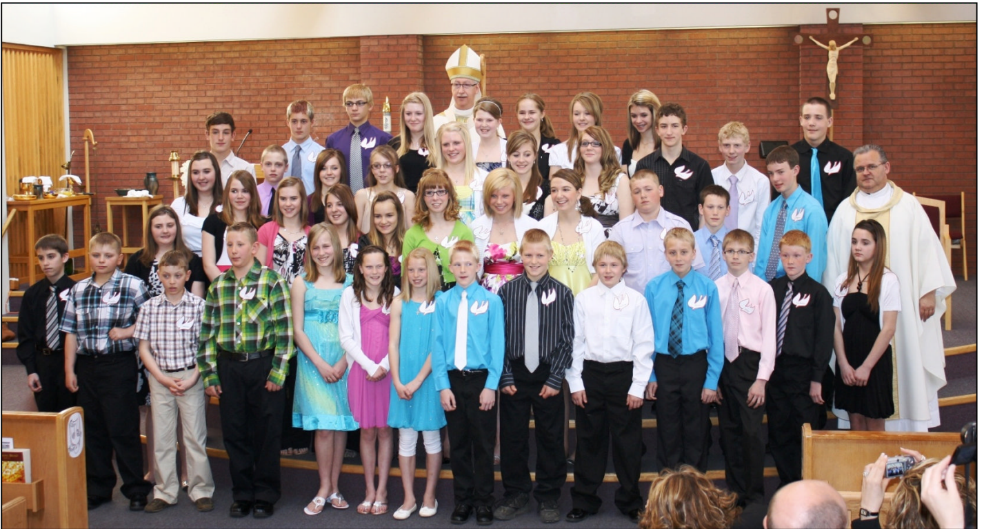
CONGRATULATIONS TO 43 CHILDREN FROM DAYSLAND, HEISLER AND KILLAM, WHO WERE CONFIRMED LAST SUNDAY!