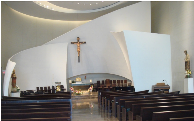
Chapel in new St. Joseph Seminary in Edmonton